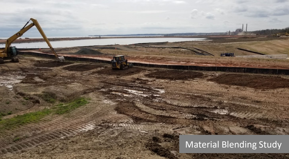
Material Blending Study