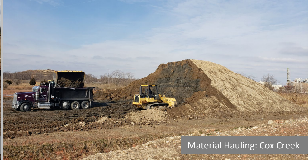
Material Hauling: Cox Creek