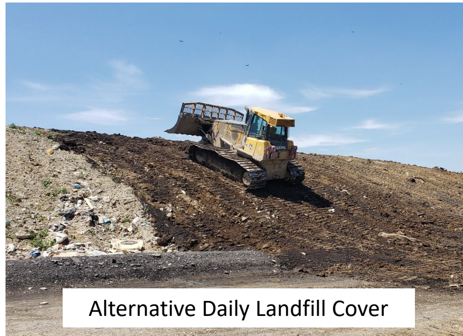
Alternative Daily Landfill Cover