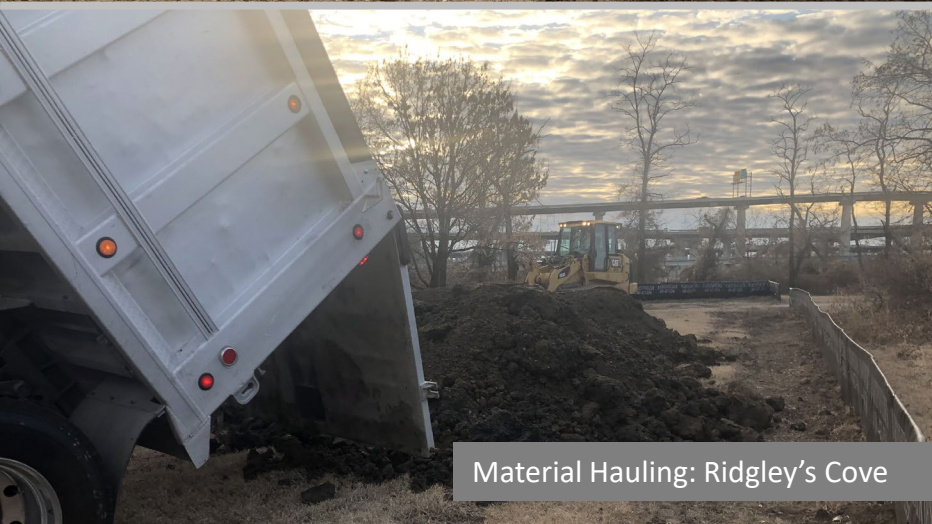
Material Hauling: Ridgley's Cove