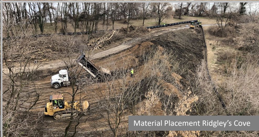
Material Placement Ridgley's Cove