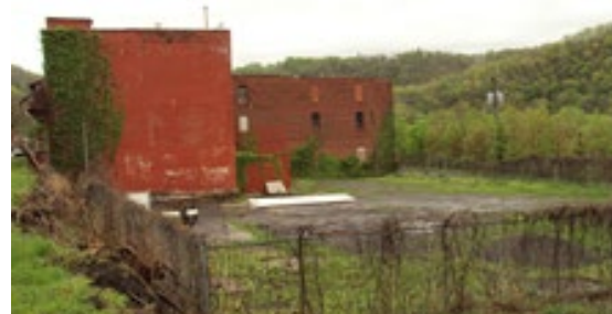
Hinton Ice House in Hinton, WV which will be part of the Rail Yard District Revitalization Plan