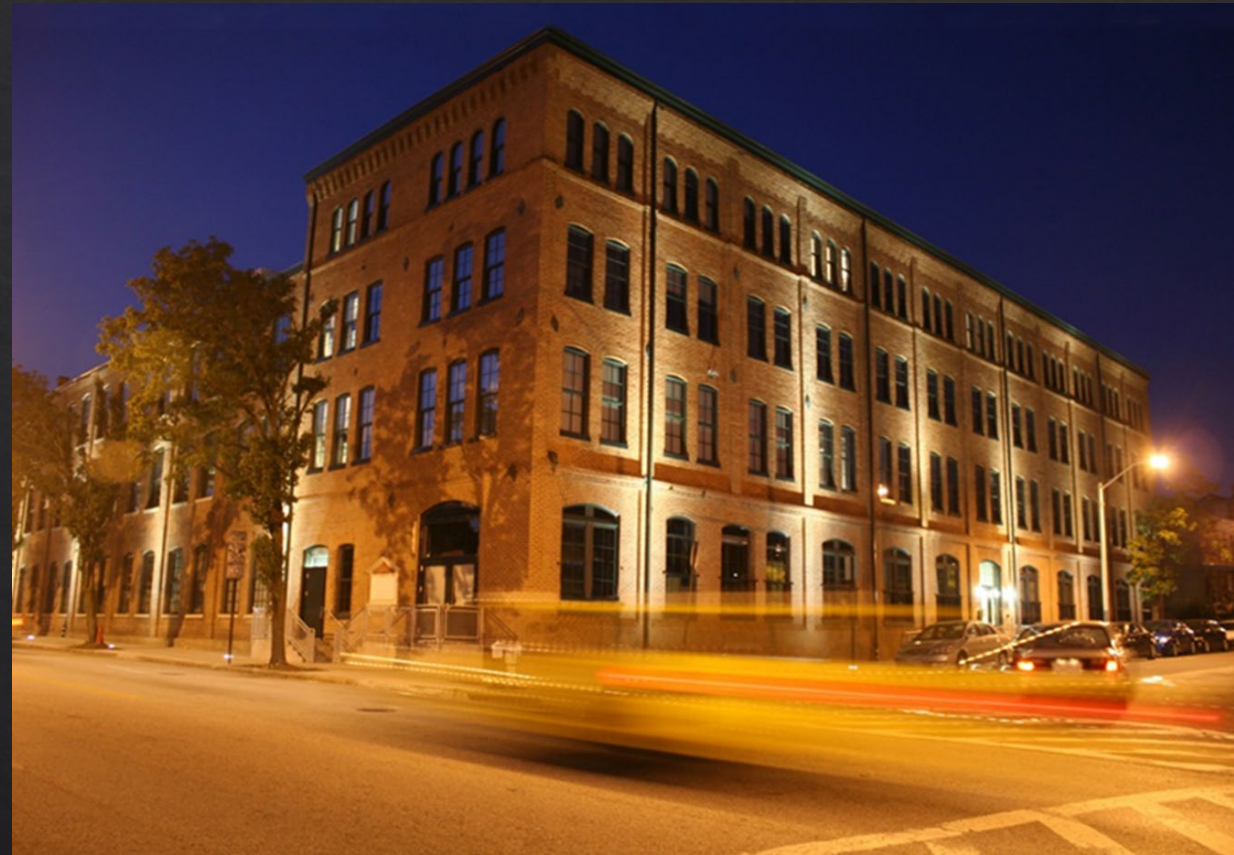
Miller's Court Baltimore, MD