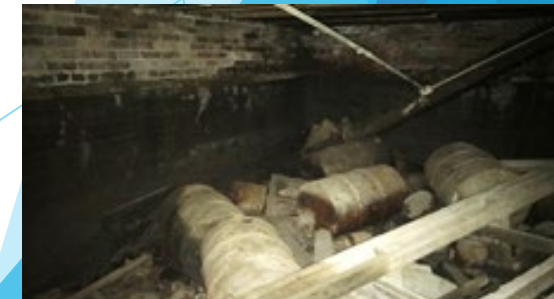
Drums found at Former Mingo Lime and Lumber site in Williamson, WV