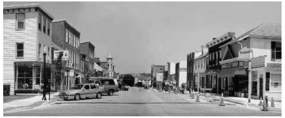
Havre de Grace offers a rich mix of commercial and residential uses.

Home Occupation: an occupation carried on by a resident of a dwelling as a secondary use within the same dwelling or within an accessory building, in connection with which there is no person employed other than a member of the family residing on the premises, there is no advertising or any other display which will indicate from the exterior that the building is being used for any purpose other than that of a dwelling, there are no retail sales on the premises, there is no advertisiing or any other display which will indicate from the exterior that the building is being used for any purpose other than that of a dwelling, there are no retail sales on the premises, no more than 10% of the dwelling area, basement area, and accessory building floor area combined is used, and no mechanical equipment is used except such as is permissible for purely domestic purposes.