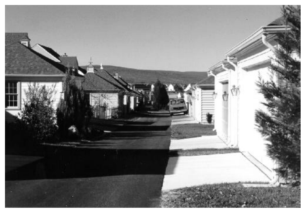
Alleys in Wormans Mill accommodate garages and allow houses to be more approachable.

There shall be a continuous network of service lanes to the rear of land uses occupied by shop fronts and attached houses.