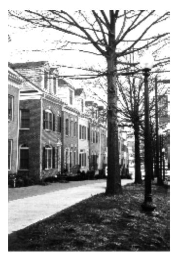
Cameron Hill accommodates vehicles via alleys, but also takes advantage of its location near the Silver Spring metro.

The quantity, location, and design of parking in smart neighborhoods reinforces the pedestrian-friendly nature of the community and encourages use of alternative modes of transportation while still accommodating vehicular traffic.