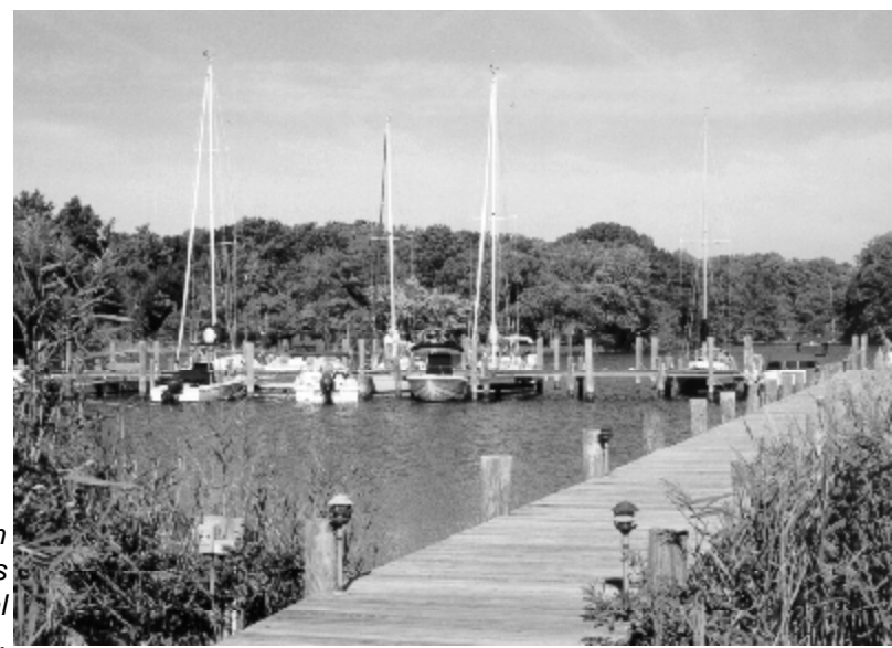
Queenstown Harbor protects its natural assets.

The natural edge consists of wilderness preserves for wildlife and marine habitats, parks protecting the natural vegetation, greenbelts, hybrid parks, heaths and undisturbed shoreline areas.