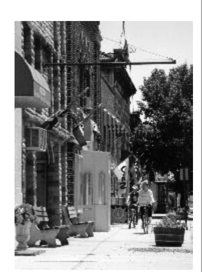
Havre de Grace

All non-residential buildings shall include an area for parking bicycles. This area may be designated parking space within the parking lot near the building or an area outside the parking lot adjacent to the building. The bike parking area must include a bike rack. The amount of the bike parking needed will depend upon demand.