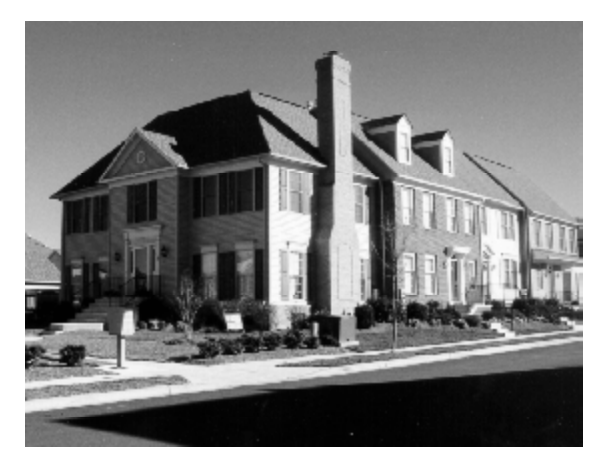
Wormans Mill demonstrates attractive, dense residential development.

Note: Maryland's Smart Growth Areas Act requires an average permitted density of 3.5 units per acre (net) inside priority funding areas. However, 3.5 net units per acre is a relatively low density. Planning literature suggests a minimum average density of 10 units per acre, or a minimum average of 15 units per acre for urban transit-oriented development.