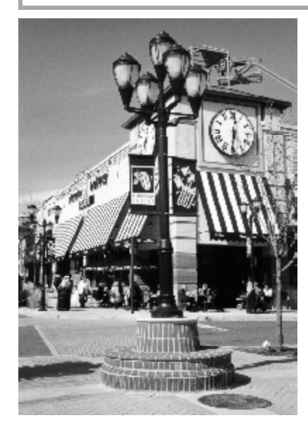
Washingtonian Center creates a sense of place through density and design.

Development Rights: All residential and commercial rights in Monroe County shall be transferable in whole or in part, from any parcel of land to a traditional village ordinance. A deed of transfer shall be recorded in the chain of title containing a covenant that prohibits further use of the transferor parcel for any other use but open space. The village property shall comprise a bundle of rights including existing and vested rights, transfer of development rights, and/or transfer of vested rights.