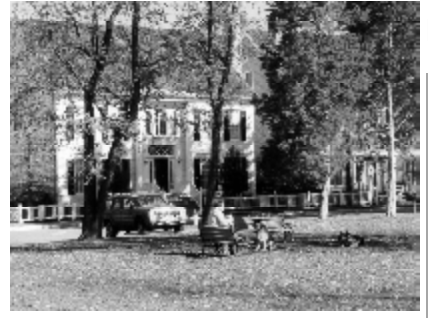
Great parks more than make up for smaller yards at Kentlands.

Design and location of open space reinforces the built environment.