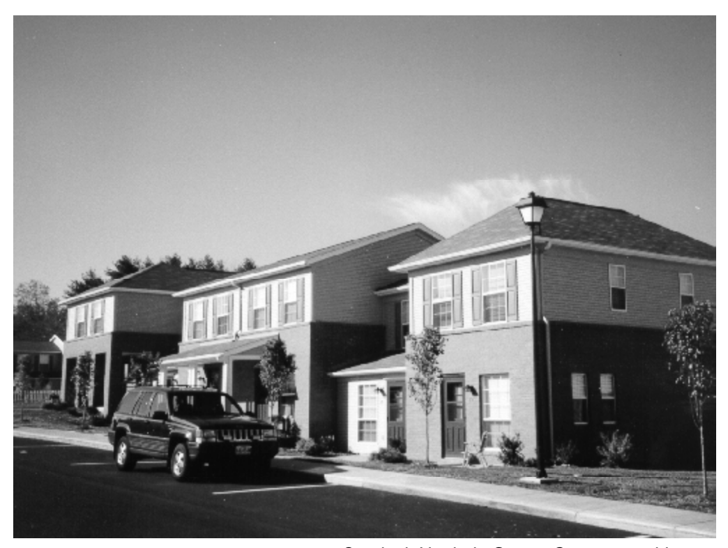
Overlook North, in Garrett County, provides onstreet parallel parking to protect pedestrians without overwhelming the street with cars.

No parking area shall be larger than 1.5 acres in first floor area unless divided by a street or building.