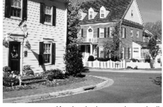
Kentlands departs dramatically from the conventional subdivision.

Smart neighborhoods provide a compelling alternative to single-use zones that offers a dramatically different and environmentally, socially, economically, and aesthetically advanced development design.