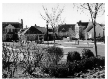
Wormans Mill offers a variety of types of open space, all close to home.

Smart neighborhoods provide open space to meet the recreational and emotional needs of residents and residents of nearby communities; preserve important natural assets; and reinforce the design of the development.