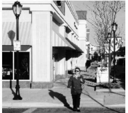
The Avenue at White Marsh provides a continuous streetscape with all buildings located adjacent to the sidewalk.

4. Stoops, and front porches may encroach up to ten feet into the front setbacks.