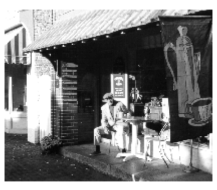
Storefronts beckon to passersk in downtown Chestertown

5. Buildings shall be oriented to face the street, with entrances and display windows at the street level.