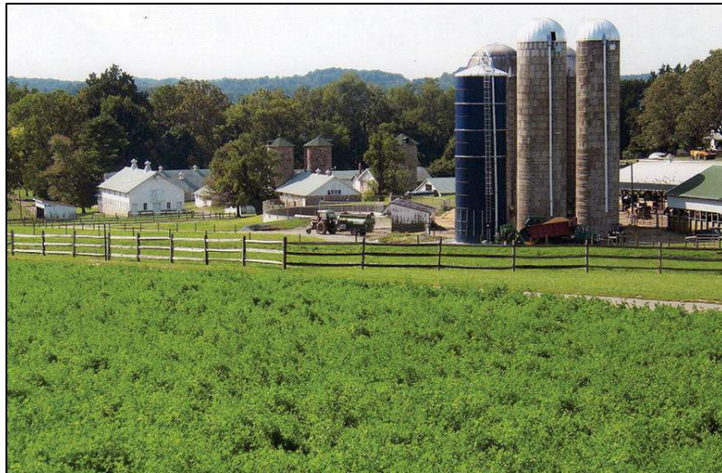
Agriculture is an important component of the County's economy and heritage.

Table 4.5 summarizes key data about Cecil County's agricultural industry. These data show