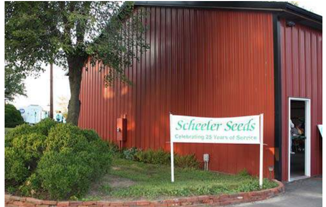
Scheeler Seeds, LLC, located near Cecilton, has been supplying seed to farmers, landscapers and homeowners in and around Cecil County for 25 years.

State law requires that all counties located on tidal waters include a Fisheries Element in their Comprehensive Plan, focusing on the designation of areas for loading, unloading, and processing finfish and shellfish, and for docking and mooring commercial fishing boats and vessels.