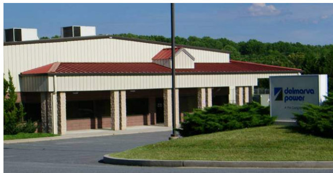
North East Commerce Center offices of Delmarva Power, which provides power for much of Cecil County.

The provision of public infrastructure, including roads in addition to water and sewer, is critical to attract and retain employment. All of the county’s