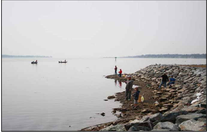
Recreational fishing is popular along the County's shores.