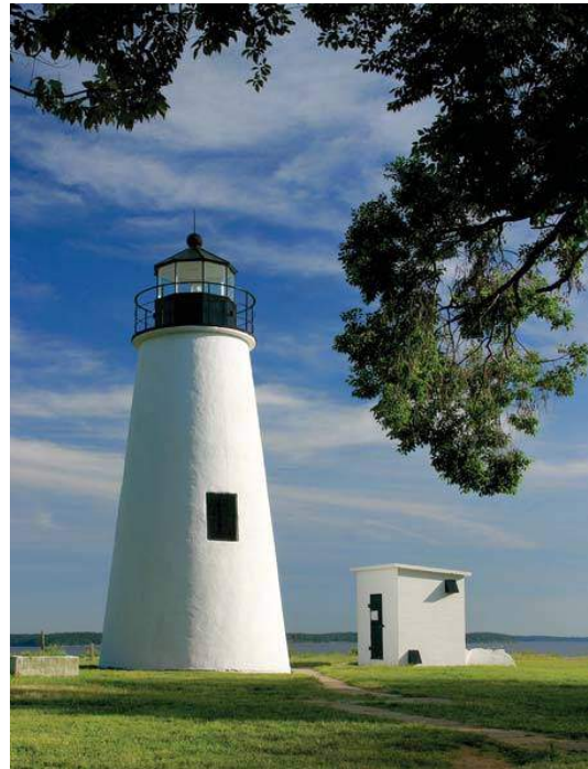
Elk Neck State Park features the Turkey Point Lighthouse, a National Register Site.

Cecil County also contains many recreational and natural areas that draw visitors. Elk Neck State Park includes 2,200 acres of forests, cabins and campsites, as well as trails, a beach and the Turkey Point Lighthouse. It is also a popular destination for birdwatchers due to hawk migration patterns. The Fair Hill Natural Resources Management Area includes 5,600 acres of natural areas and 40 miles of trails. Together, these two state parks are the most popular