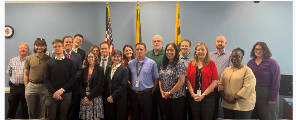
Images from the Spring 2025 Regional Planner Roundtables