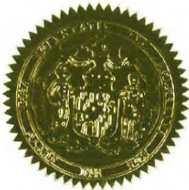
Wes Moore Governor

GIVEN UNDER MY HAND AND THE GREAT SEAL OF THE STATE OF MARYLAND, in the City of Annapolis, this 3 rd day of July, 2023.