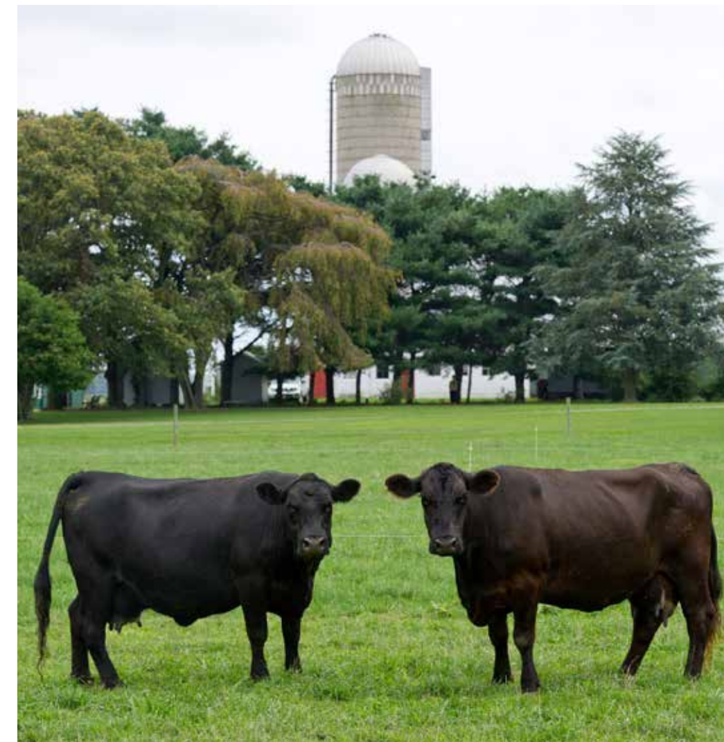
Beef farm in Kennedyville, Maryland.

Source: Livestock Inventory: 2017 U.S. Census of Agriculture (Baltimore City not included in Agriculture Census 2017)