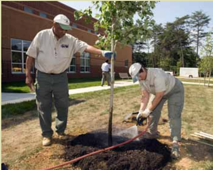
Planting green landscaping at Vansville Elementary School.