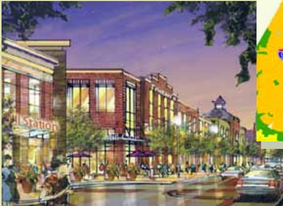
Laurel Commons Town Center is one of the focal points for the City of Laurel's BRAC Zone (right).