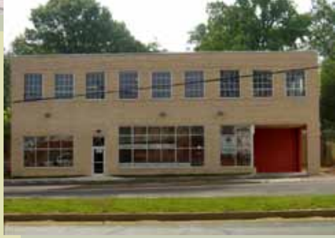
Before and after photos of the Brentwood Arts Center.